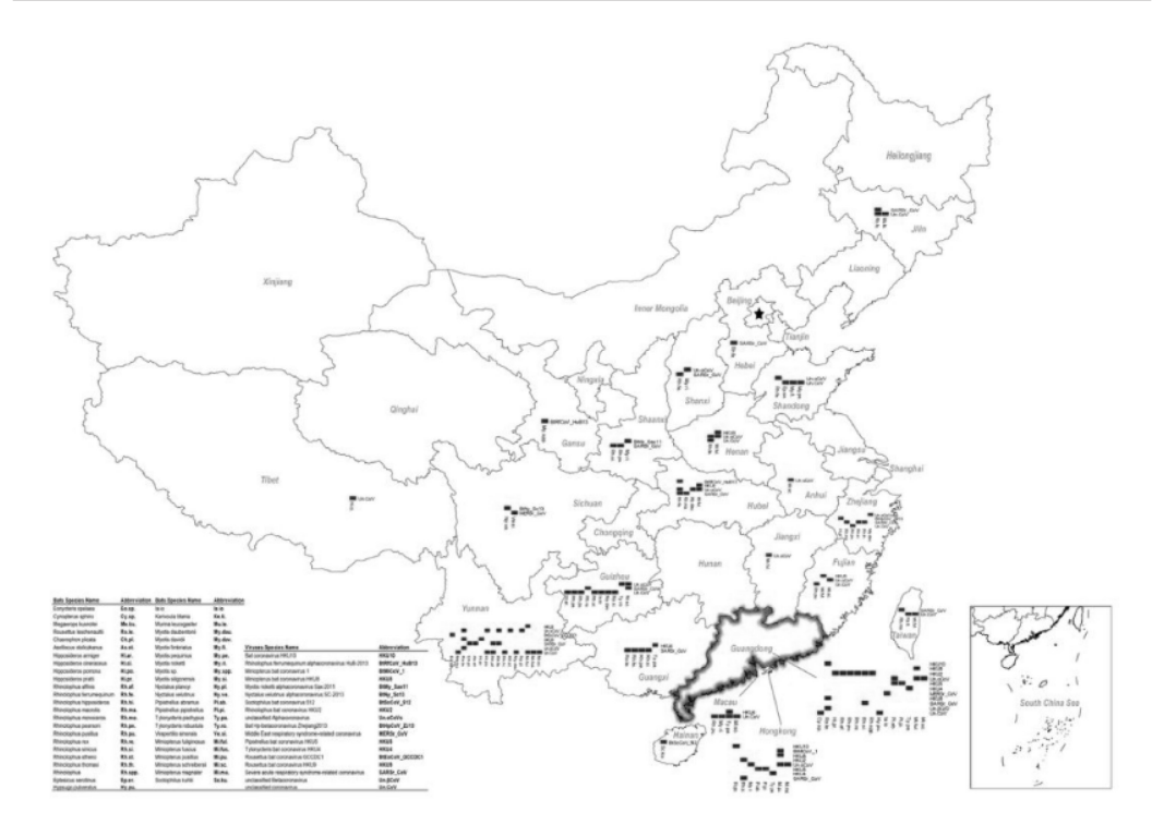
Figure 2. Distribution of bat coronavirus in China